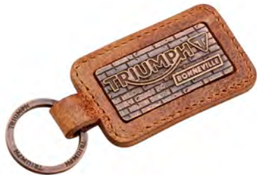
BONNEVILLE BRICK KEY RING Code MKRA16382