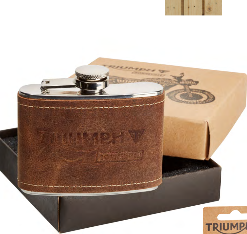
BONNEVILLE HIP FLASK Code MGBS16869