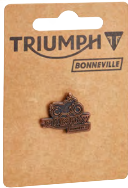
BONNEVILLE PIN BADGE Code MPBS16364