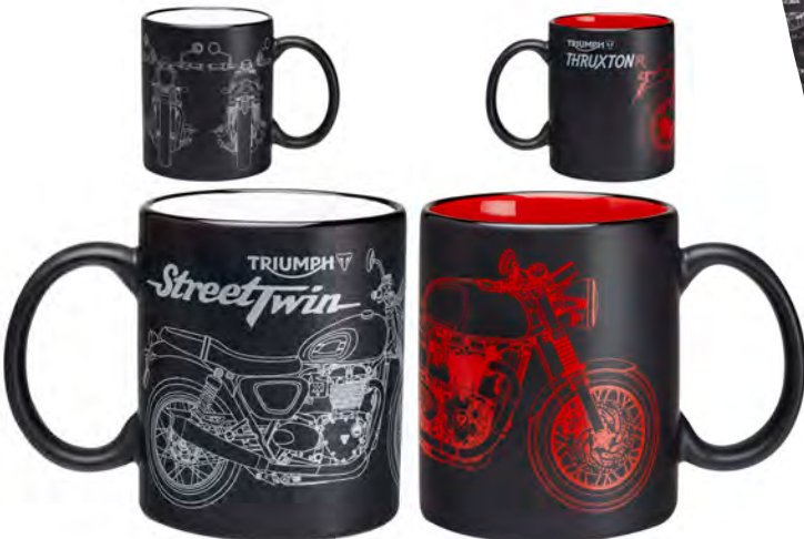
STREET TWIN MUG Code MMUA16384 Black & Silver