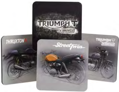
BONNEVILLE PROMO COASTERS Code MGBA16380