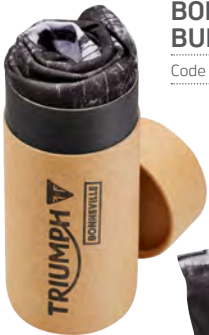
BONNEVILLE NECK BUFF IN TUBE Code MNBS16367