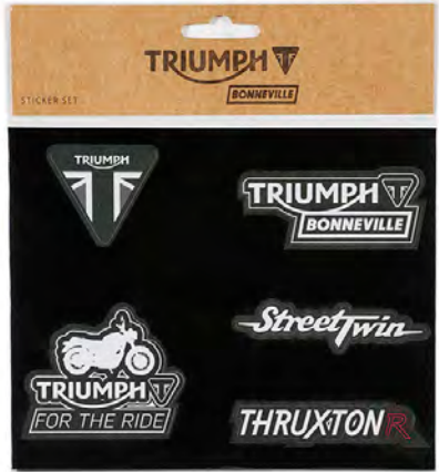
BONNEVILLE STICKER PACK Code MSSS16365