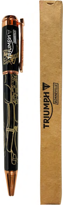
BONNEVILLE PEN IN BOX Code MPEA16337