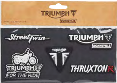
BONNEVILLE PATCH SET Code MPAS16368